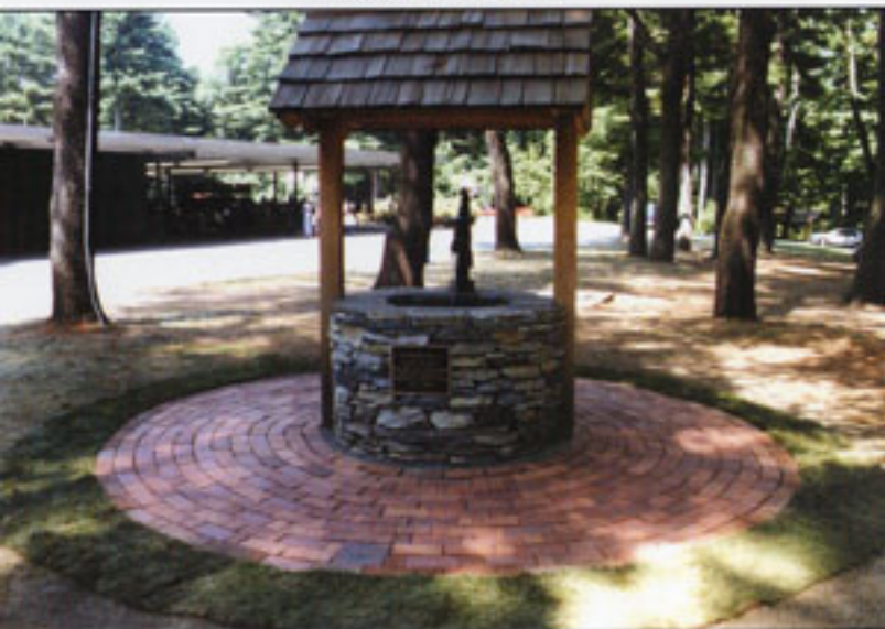
HARTFORD'S CAMP COURANT HARTFORD, CT