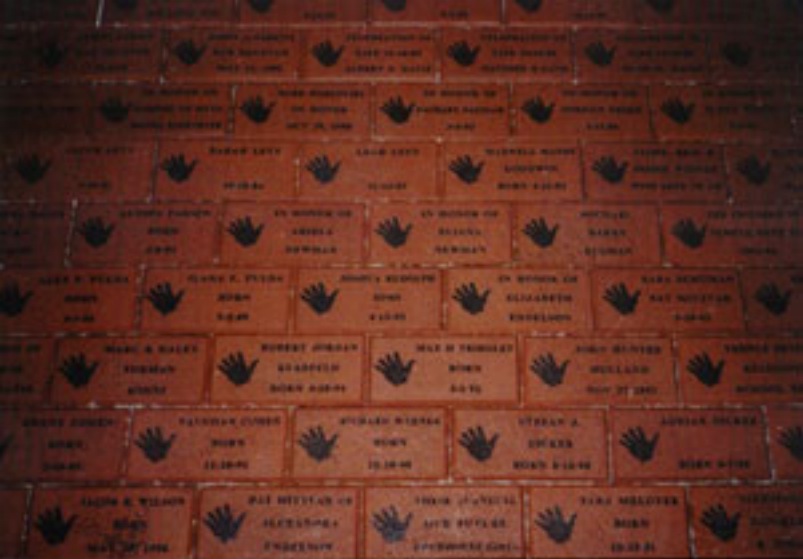
CHILDREN'S WALKWAY BOCA RATON, FL