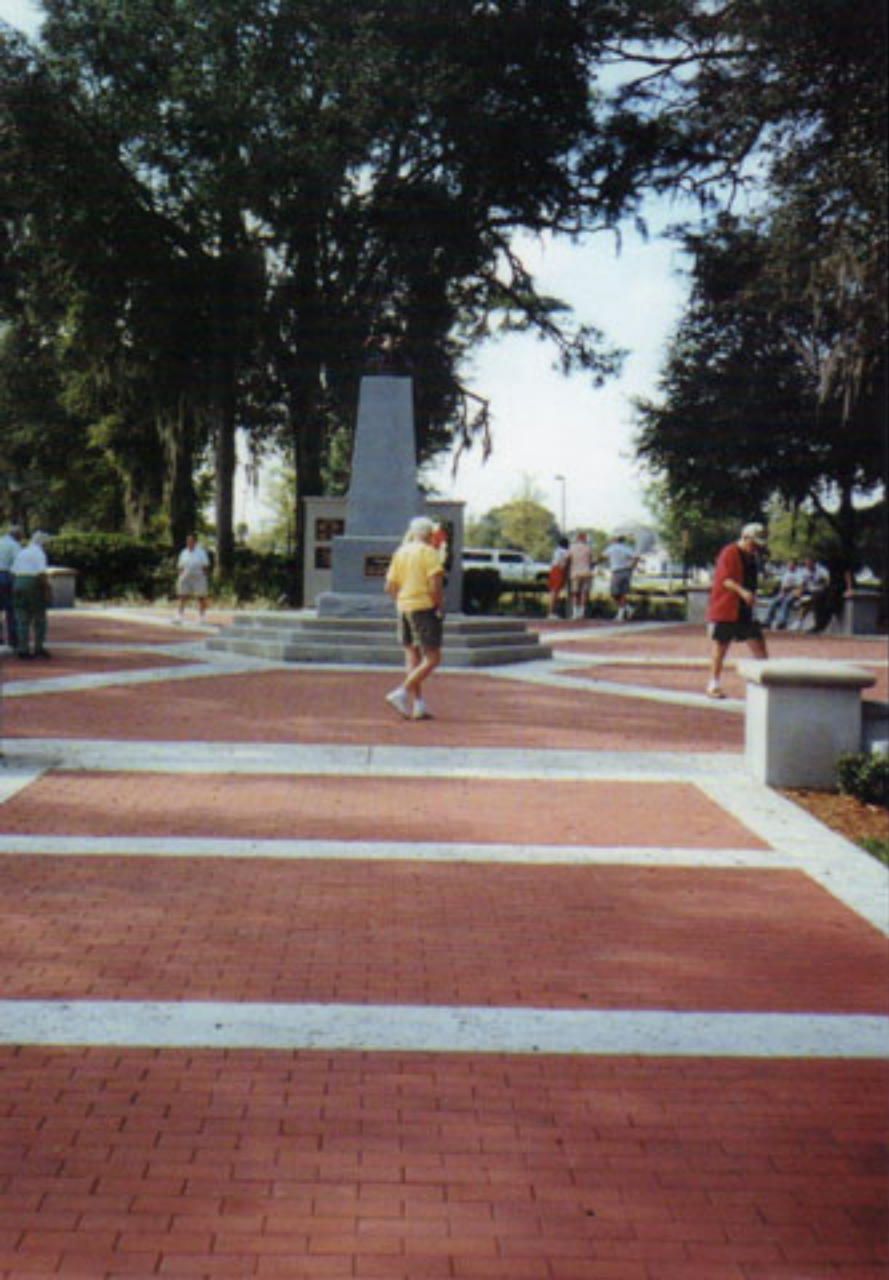
VETERAN'S MEMORIAL THE VILLAGES, FL